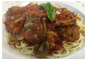
Spaghetti - The Works